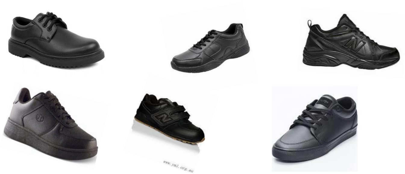
Examples of Inappropriate shoes These shoes have either canvas or mesh tops, or aren't totally black.